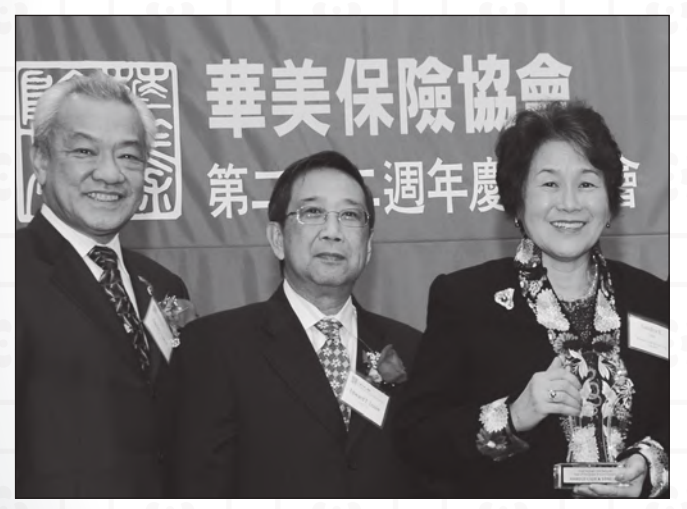
Bronze Sponsor Harold L. Lee & Sons Inc.