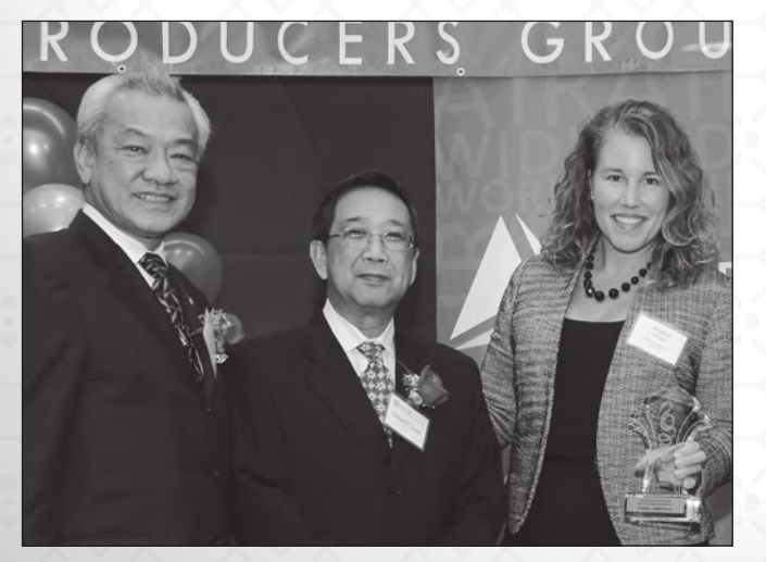
Silver Sponsor Starr