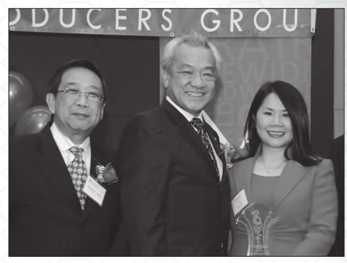
Silver Sponsor Magna Carta