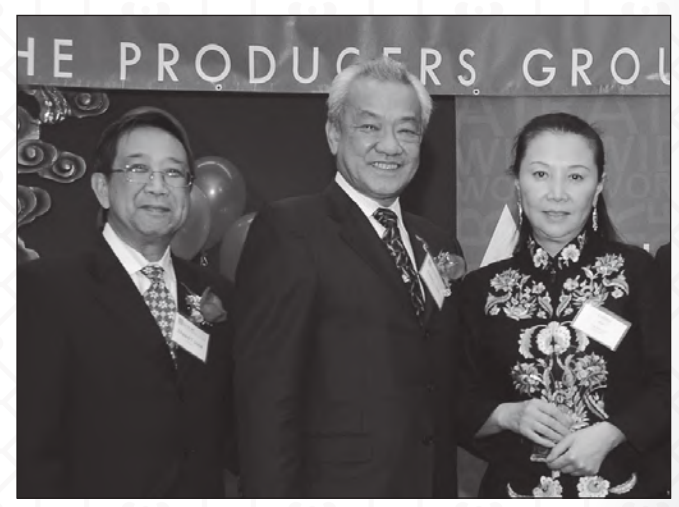
Bronze Sponsor C & M First