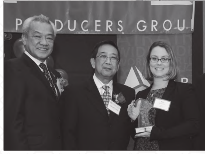
Bronze Sponsor ACE