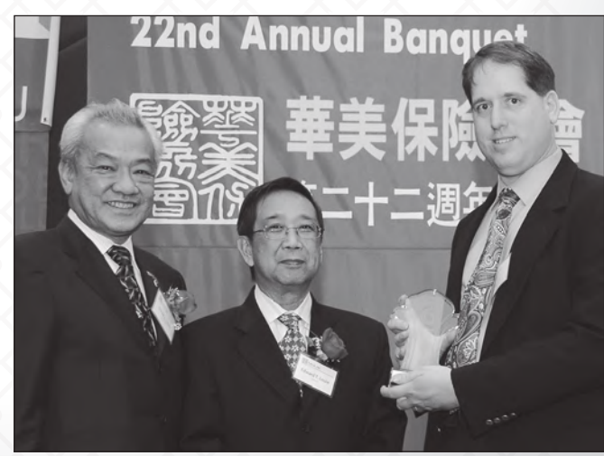
Bronze Sponsor LIG